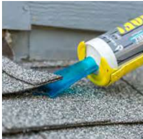
Tab down shingles