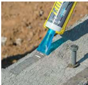
Sill plate seals