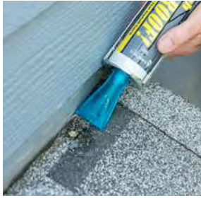
Over roof nails