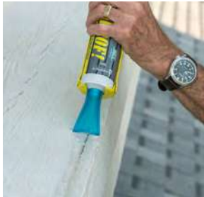
Window shadow boxes